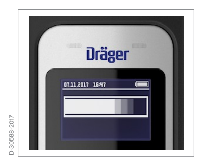
"Test Progress Display" symbol