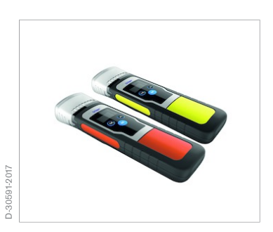
Optional reflector film set (yellow or orange)