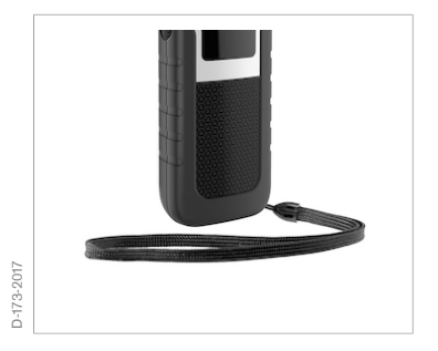
Grips and wrist-straps for secure holding