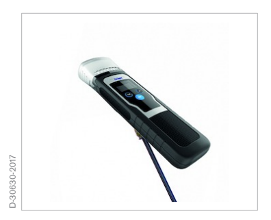
1/4" thread for mounting a selfie stick